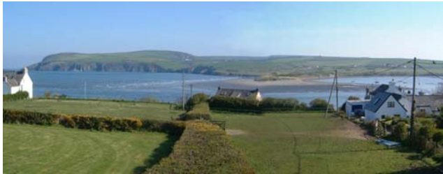
View from the house.

ERW WEN is only a minute from Newport Parrog, with its sands, boating, walks, dunes and estuary .